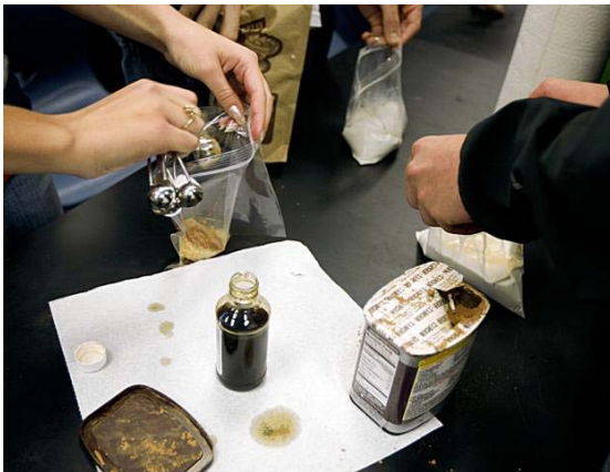
Students combine ingredients for ice cream, like an experiment their teacher will conduct.